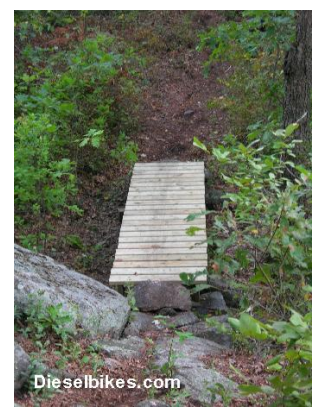
Ladder Bridge Lynn Woods "Powwow Trail"

We wish them luck and look forward seeing their results this season.