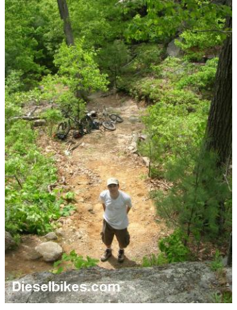
Working Hard? Or Hardly Working?

Sunday November 10th: Additional trail day if required.