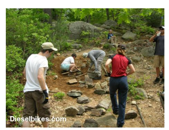
The Trail Crew Hard at Work