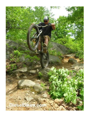
Making sure the rocks do not move!