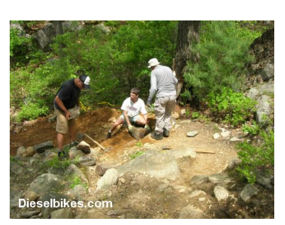
Putting the Puzzle Together