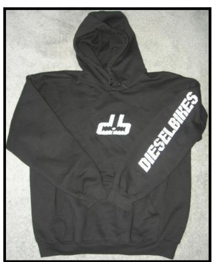
New Hooded Pull-Over $30.00 each (Free Shipping)

Check out this product and other apparel items on our <u>website</u> or <u>by clicking this link</u>. Remember, monies collected go right back to the trails we support.