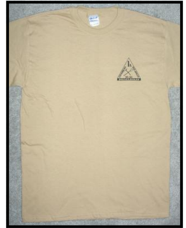
T-shirt Front with Lynn Woods Trail Advocate Stamp!

This shirt is a 50/50 blend of ultra cotton and polyester and has our Trail Advocate Stamp located on the front left chest, plus a full listing of the 2008 Trail Series Work Dates on the back. Shirts are tan color with black print on both front and back. Available sizes are X-Large, Large and Medium.