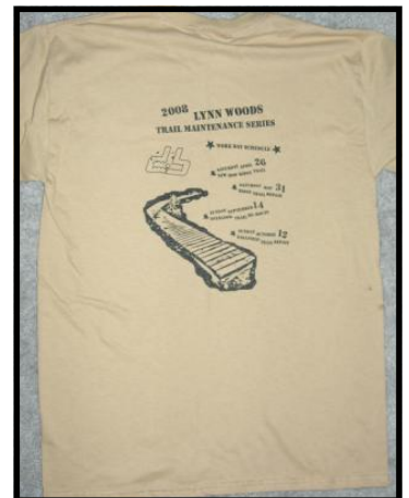
T-shirt Back with Lynn Woods Trail Work Schedule!