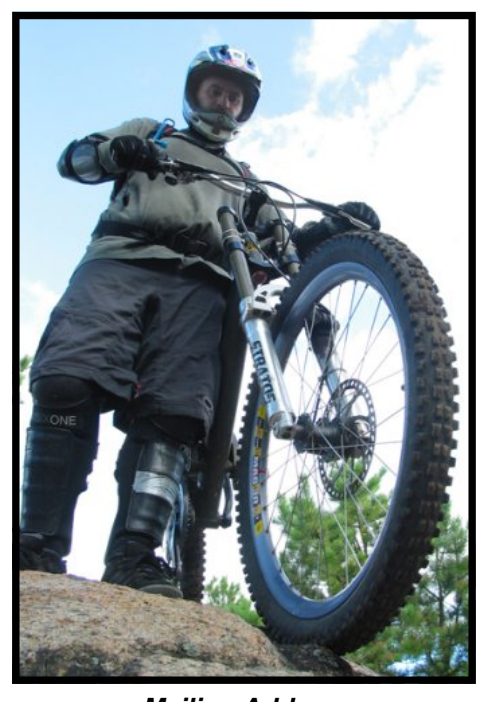
Mailing Address P.O. Box 724 Lynnfield, MA 01940

Whether posting pictures, videos, local trail maps and/or scheduling biking trips, we are starting small and keeping it simple. Someday our secondary goal is to build downhill/freeride bikes and or bike components for anyone who wants bulletproof products tested on FLAT DROPS here in New England.