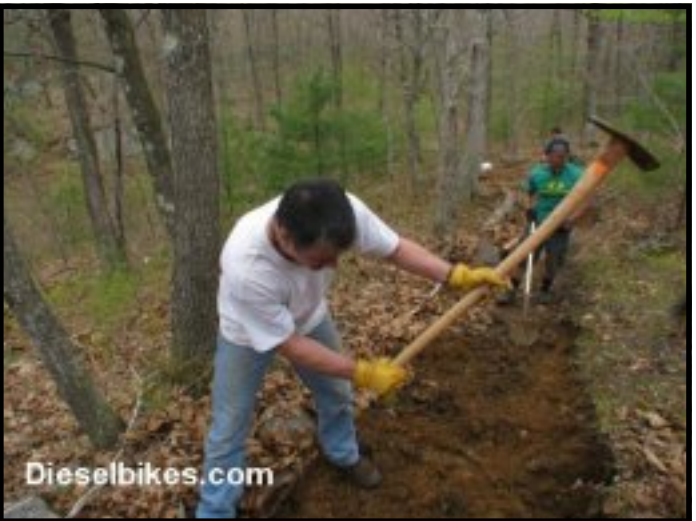
Click here to see more trail day pictures