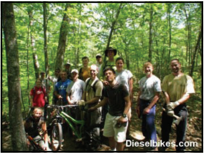
Click here to see more trail day pictures