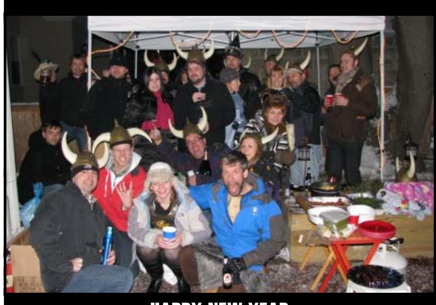
HAPPY NEW YEAR