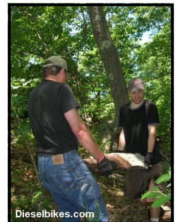
We need more stone!