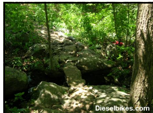
The final product!