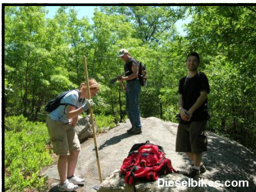
What is going on here?