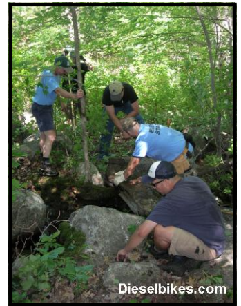
Stone Bridge Build

Sunday November 10th: Additional trail day if required.