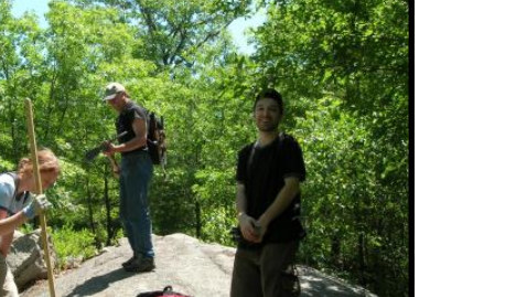
What is going on here?