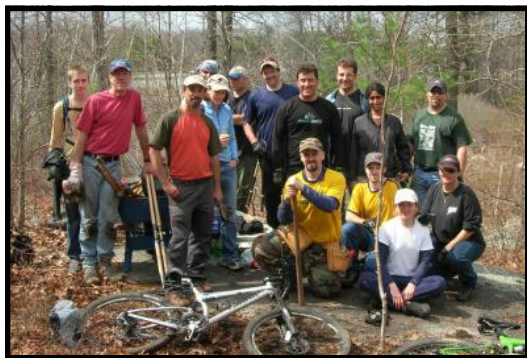
2007 Trail Crew—Project #1