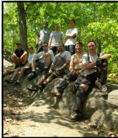
2005 Trail Crew— Project #3

Lynn Woods is loved by many riders both local to New England and outside this region. We cannot say thanks enough to the individuals that spent there time volunteering for our trails days and or events. Hats off to all that support us and to all that are a part of this growing club. Again, we