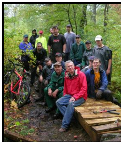
2006 Trail Crew— Project #5