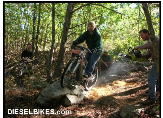
Fellsbiker Riding To Save His Life!