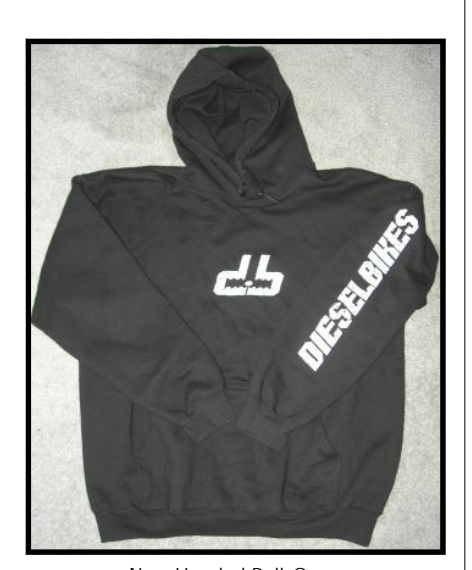
New Hooded Pull-Over $30.00 each (Free Shipping)