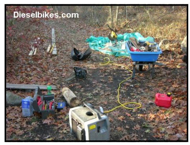
Tons of Tools!