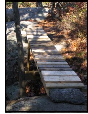
New Bridge build by other local Mountain Bikers