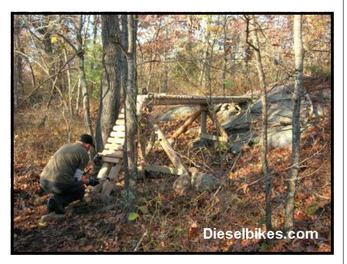
Nailing in the last few pieces