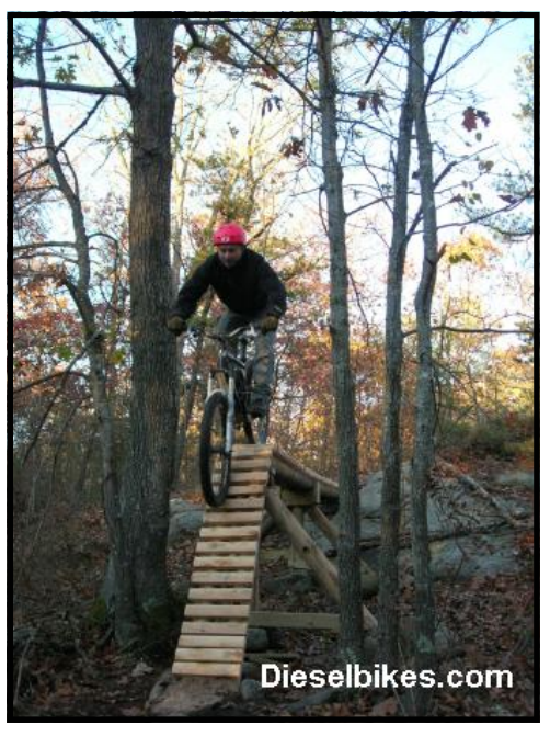
Bruce testing it out!