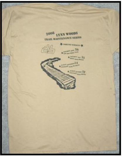
T-shirt Back with Lynn Woods Trail Work Schedule!

This shirt is a 50/50 blend of ultra cotton with polyester and has our designed Trail Advocate Stamp located on the front left chest, plus a full print of the 2008 Trail Series Work Dates on the back. Shirts are Tan color with black print both front and back. Available sizes are X-Large, Large and Medium.