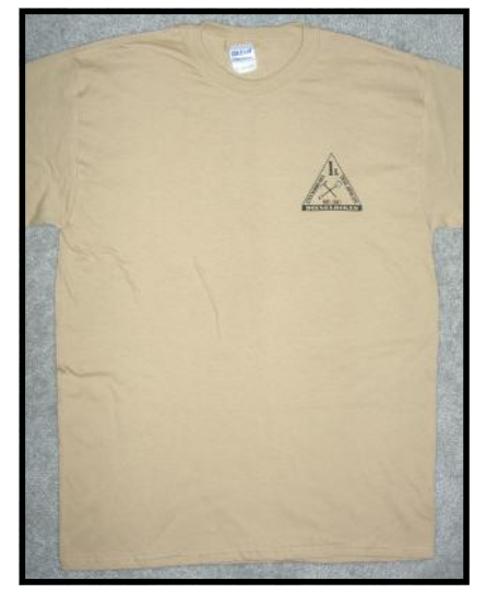
T-shirt Front with Lynn Woods Trail Advocate Stamp!