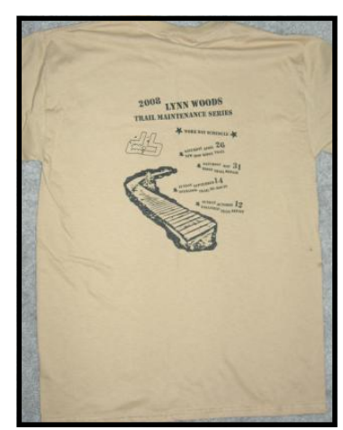
T-shirt Back with Lynn Woods Trail Work Schedule!