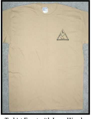
T-shirt Front with Lynn Woods Trail Advocate Stamp!